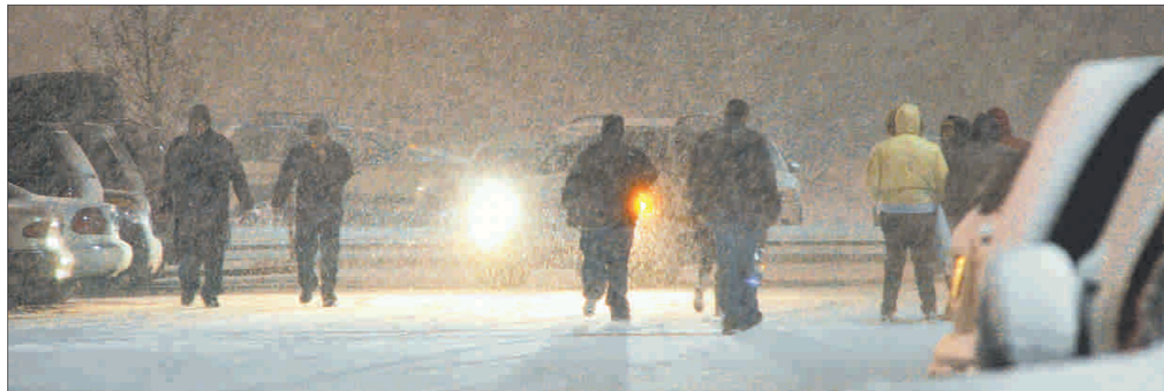
Hardy shoppers walk through the Staten Island Mall parking lot as the storm intensifies early last night.