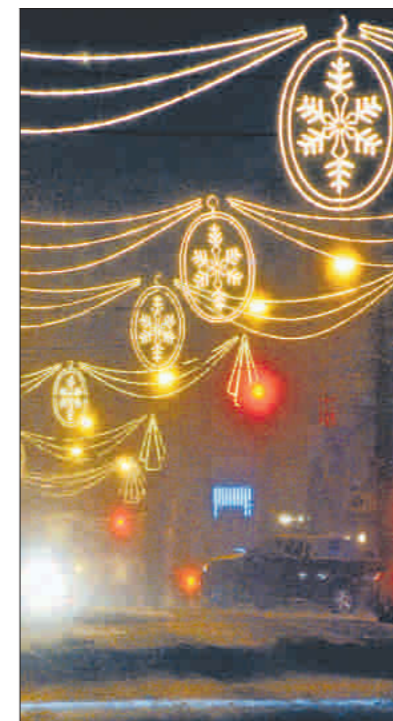
Snowflakes along Forest Avenue — both real and incandescent — make for a pretty picture.